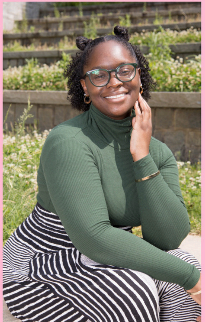
Vanna Black @therealvannablack vannablack.art